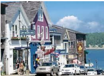
Main Street in Bar Harbor