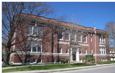
Town of Bar Harbor Municipal Building